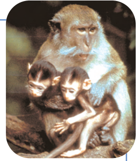
liberated monkeys, thanks to activists just like you

Please make sure we have your contact details, email address, mobile number so we can add you to our text email alert list, animals are counting on you - don't miss out!